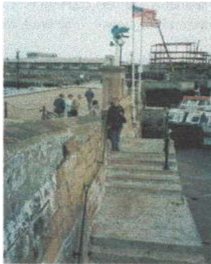
Mayflower land at Plymouth

Plymouth has a long association with colonisation beginning with the 'Pilgrim Fathers', who set sail for America in 1620. Its old quays are scattered with stones and plaques, commemorating journeys to new lands all over the world.