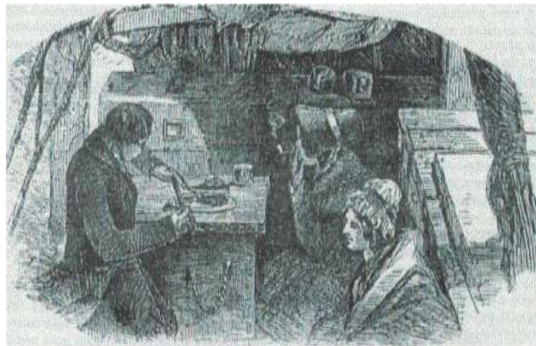
Having a meal on board ship